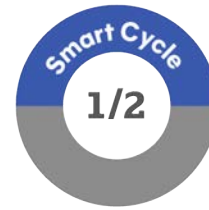
Pre-Transfer Embryology Services