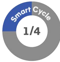
Frozen Embryo Transfer (FET)