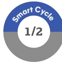
Frozen Oocyte Transfer (FOT)