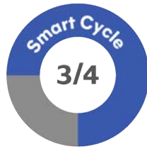
IVF Freeze-All Cycle