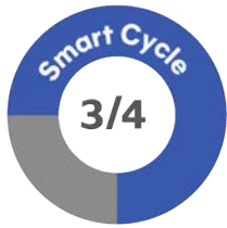
IVF Fresh Cycle

Visit the Explanation of Covered Treatments & Services section of the Member Guide to learn more about what's included in each Smart Cycle and additional covered services. Unless specified, the stated Smart Cycle value for treatment is applied in full, even if you choose to forego any included services. For a full explanation of what's covered under each Smart Cycle, visit the Definitions for Covered Services section.