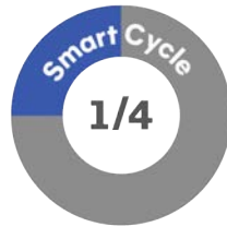
Timed Intercourse (TIC)